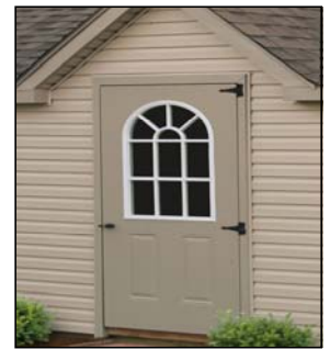
Fiberglass Door w/Glass