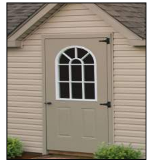
Fiberglass Door w/Glass